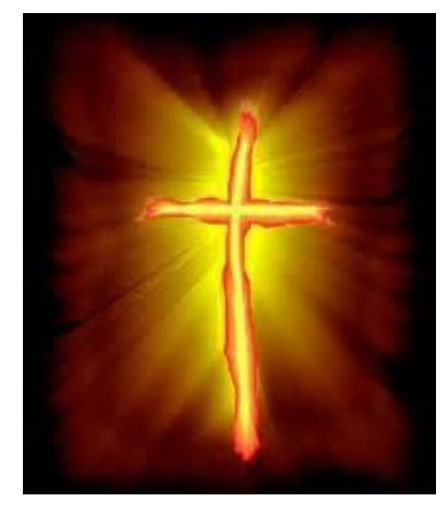
Tap here to add a caption